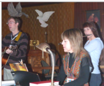
LEFT: KC musicians

Newsletter deadline for photos, articles, etc. is 20 th of each month unless otherwise stated