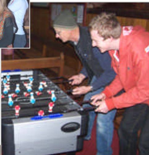
BELOW: Coat of many colours